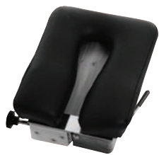
Narrow Base Adult Drop Head Shown