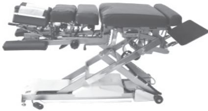
Shown With Optional Drops