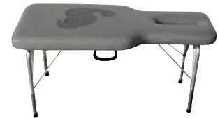
C106 Child's Portable Table *Shown with optional Dinosaur Logo