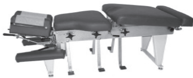
Shown With Optional Drops