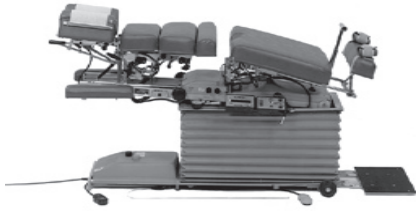
Shown With Optional Drops

One Piece Adjustable Chest With Adjustable Tension Spring Breakaway Chest/Pelvic Separation (Power) Extension/Retraction of Length (Power) Adjustable Ankle Rest (Vertical & Horizontal) Pelvic Section: Flexion Distraction (Man.,Semi-Auto, Auto) Lateral Bending Axial Extension/Retraction (Power) Ankle Straps Speed Adjustment of Hylo Feature Tilt Safety Switch Long Lasting Naugahyde Upholstery (see pg.16)