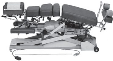
Shown With Optional Drops

Deluxe/Adjustable Headpiece Lumbar Extension Cushion One Piece Adjustable Chest With Adjustable Tension Spring Breakaway Chest/Pelvic Separation Extension/Retraction of Length Pelvic Section: Flexion Distraction (Manual & Semi-Auto) Lateral Bending Axial Extension/Retraction (Power) Adjustable Ankle Rest (Vertical & Horizontal) Ankle Straps Hydraulic/Semi-Automatic Height Variation Long Lasting Naugahyde Upholstery (see pg.16)