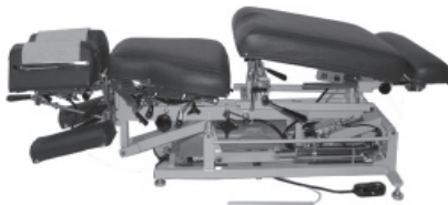
Shown With Optional Drops