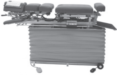
Shown With Optional Drops